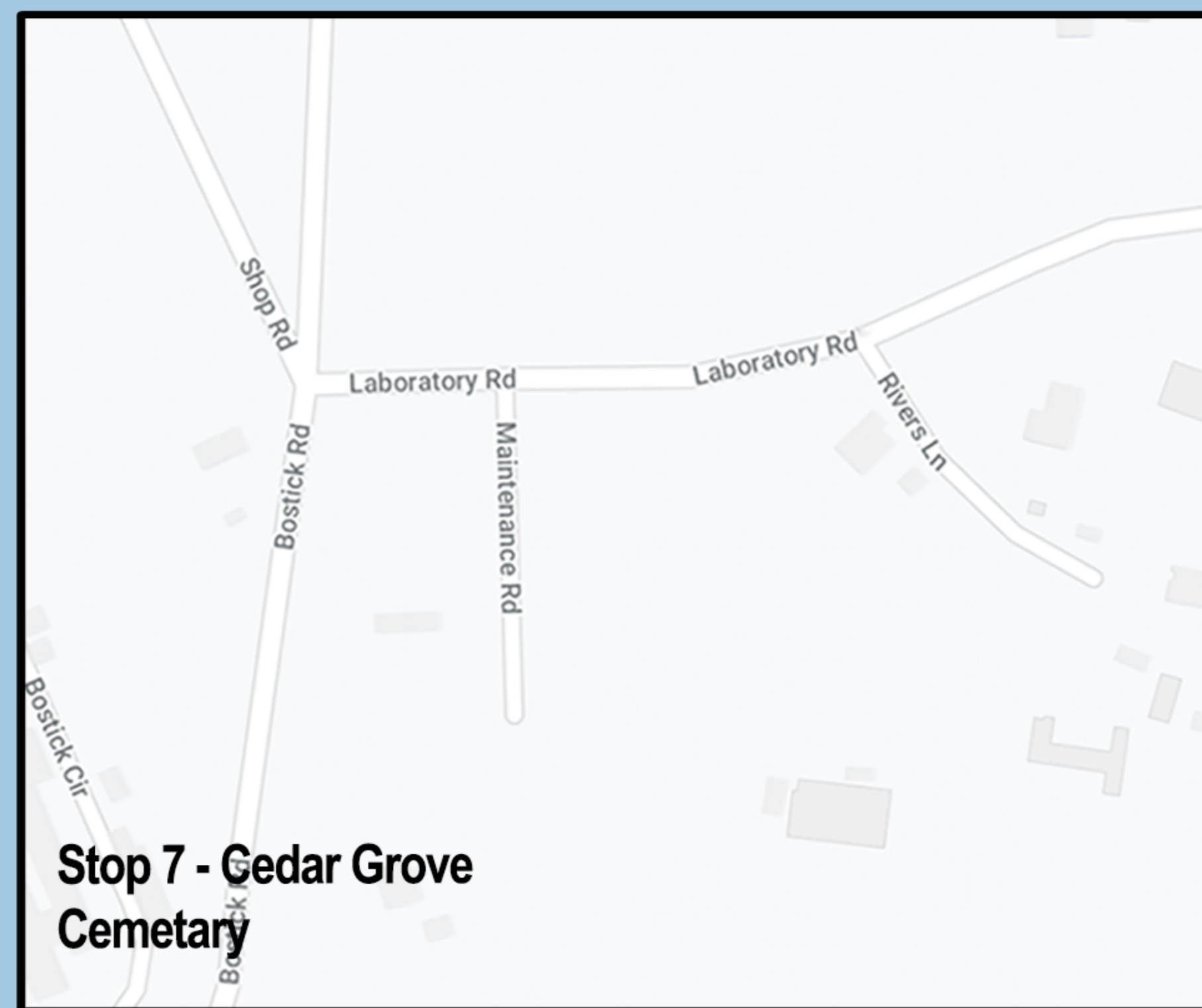
Stop 7 - Cedar Grove Cemetery