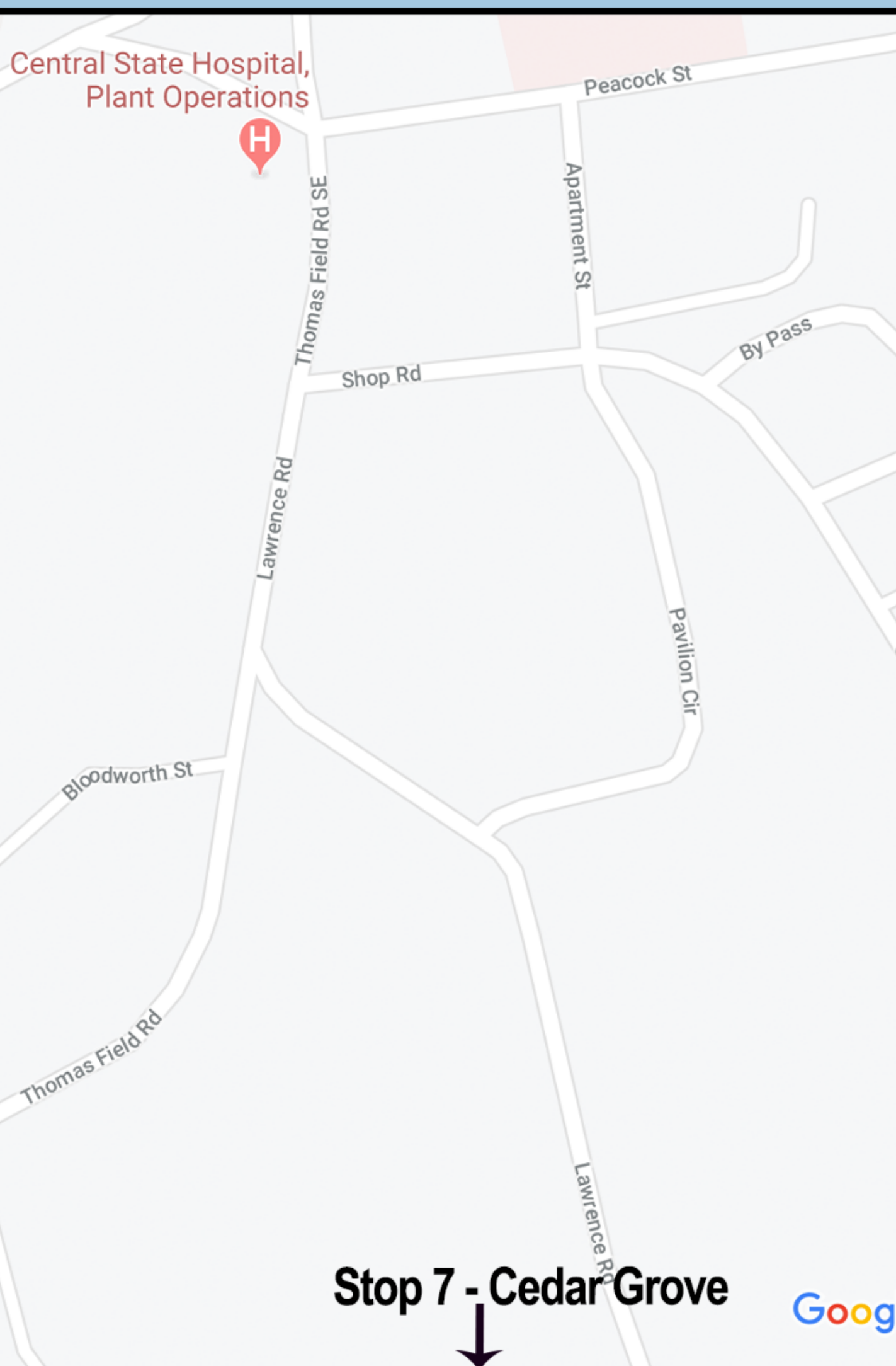
Stop 7 - Cedar Grove

After Cemetery, drive north on Lawrence, take a right on Peacock then take a right on Swint Ave. Park in front of Yarbrough